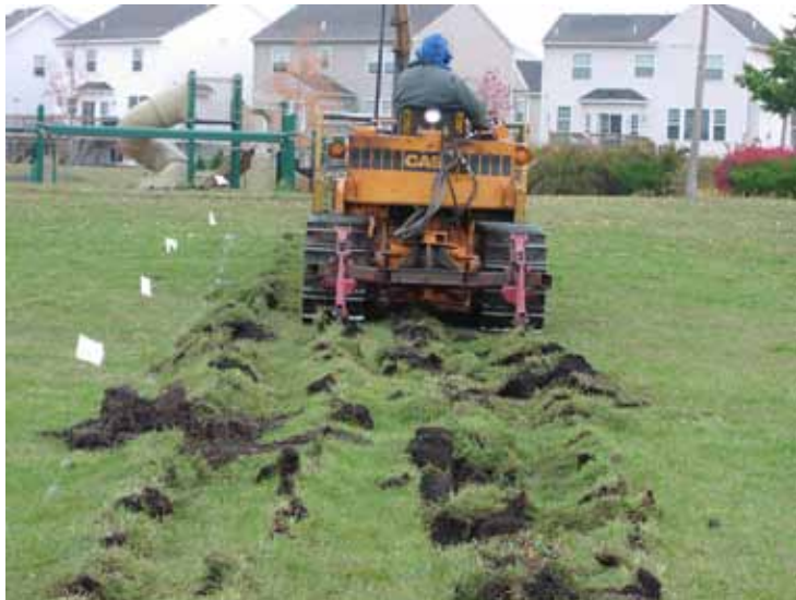
DEEP TILLAGE BEING PERFORMED AT MAPLE LAKES PARK, MAPLE GROVE, MN (OCTOBER, 2008).

Improvements in infiltration can be achieved by remediating the soil using tillage and compost addition. Tillage breaks up hard pan layers allowing water to infiltrate faster and to greater depths. Compost addition reduces the density of the soil and increases water holding capacity.