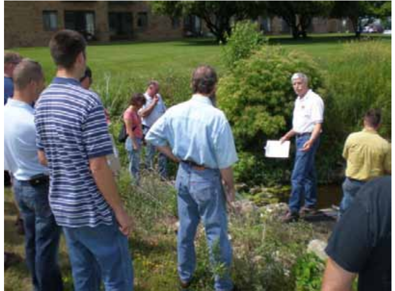
STORMWATER U TRAINING WORKSHOP ON WET DETENTION POND INSPECTION AND MAINTENANCE IN NORTH ST. PAUL, MN (JULY, 2008).